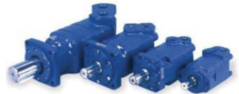
4K/6K/10K SERIES MOTOR