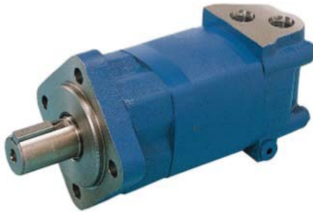
2K SERIES MOTOR