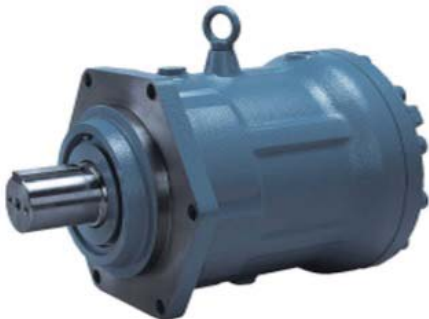
ME SERIES MOTOR