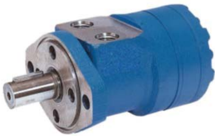
H/S SERIES MOTOR

Applied to fishing equipment, deck equipment, steel facilities, agricultural machinery, heavy construction equipment, and other hydraulic systems